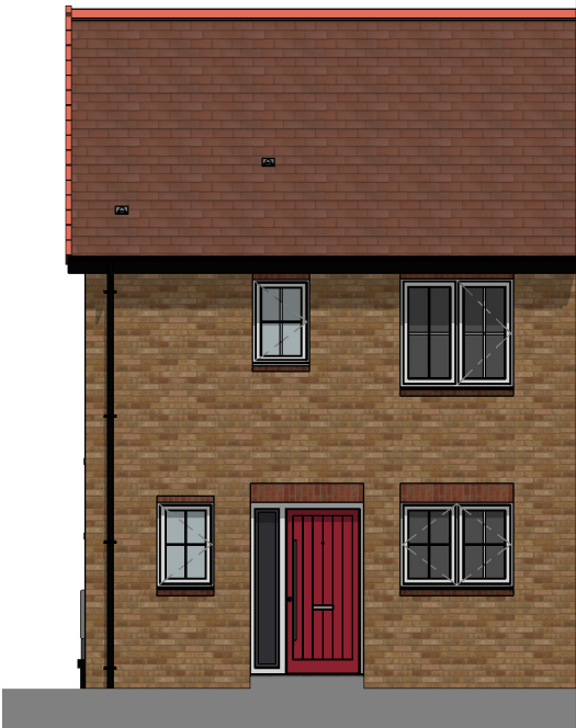
Front Elevation. 1 : 100