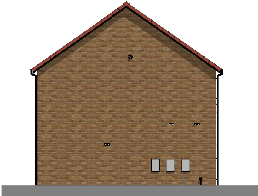
Left Elevation. 1 : 100