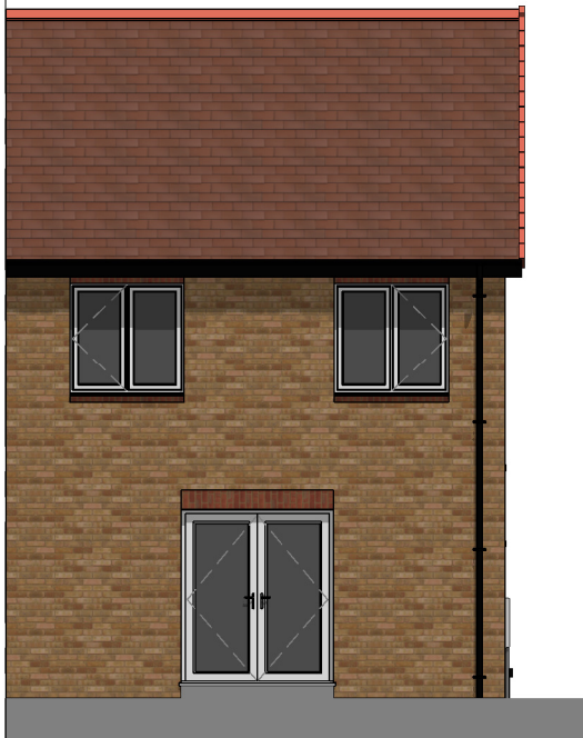
Rear Elevation. 1 : 100